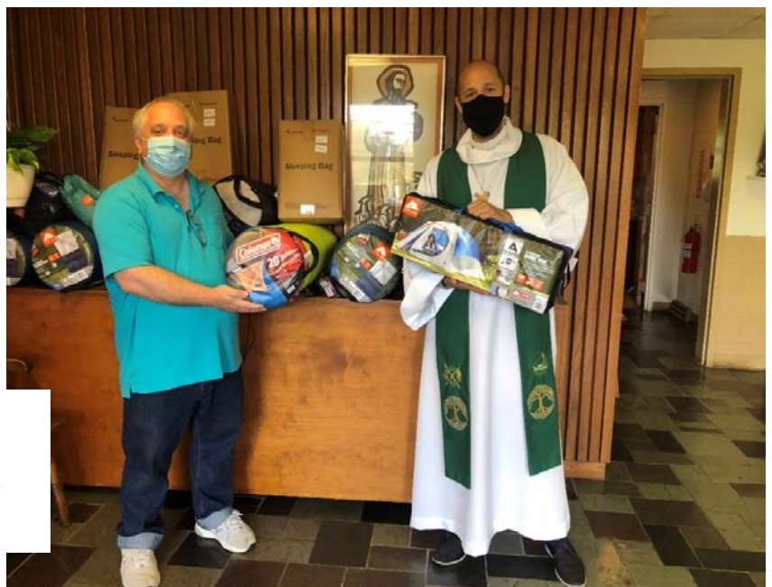
Pastor and Leo pictured at church with cold weather supplies collected for United Way of New Haven