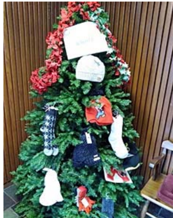
Our Winter Warmth Tree