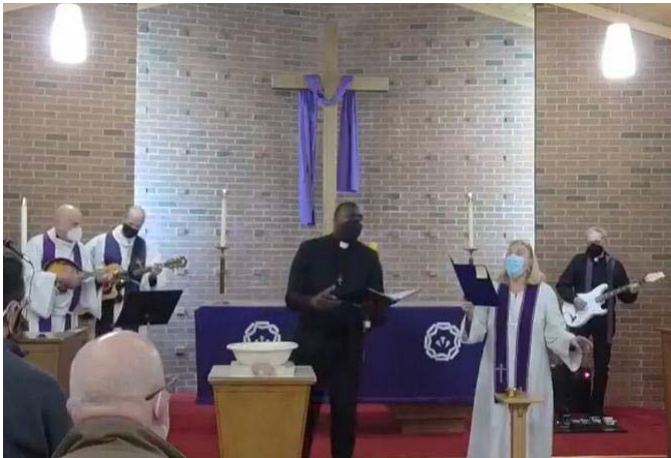
The Hamden Interdenominational Clergy Band leads a rousing rendition of "I'll Fly Away."