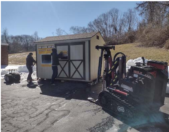
A St. Pauly Used Clothing Drop-Off shed is installed at CGSLC

Please do not donate the following: Books, furniture, electronic items of any kind, toys (other than stuffed animals), pillows, household or kitchen items, rags or fabric scraps, etc.