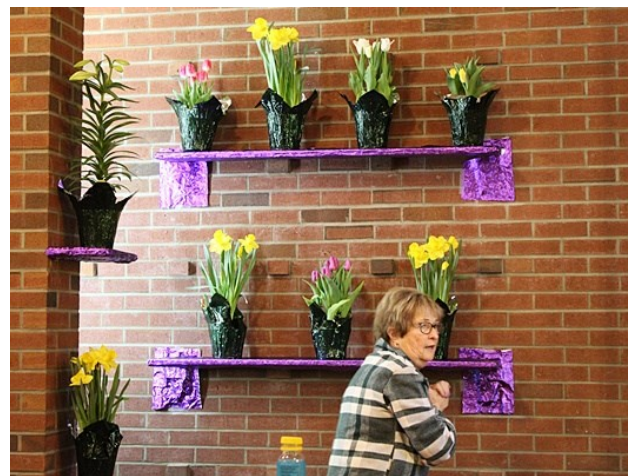
Starr making final adjustments to plant placement.