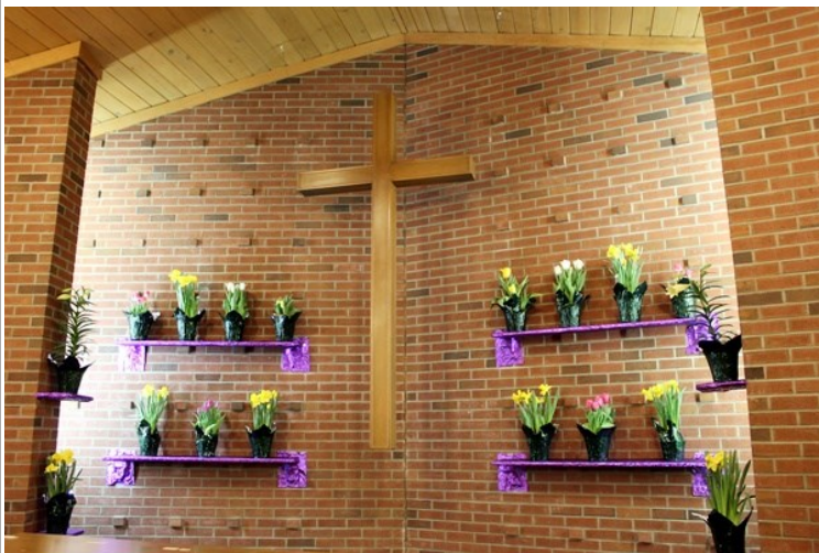
The beautiful display completed-ready for Easter Sunday!