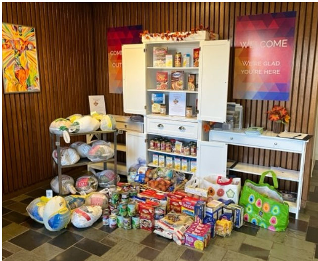
Narthex takes on a fresh new look, in time for this year's food drive.

Ordered plants may be taken home after Christmas services.