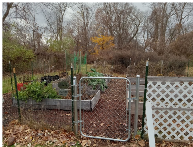
Garden cleaned up and put to rest for the winter.

In January, we will start planning for next year’s garden. All suggestions, input, and offers of help