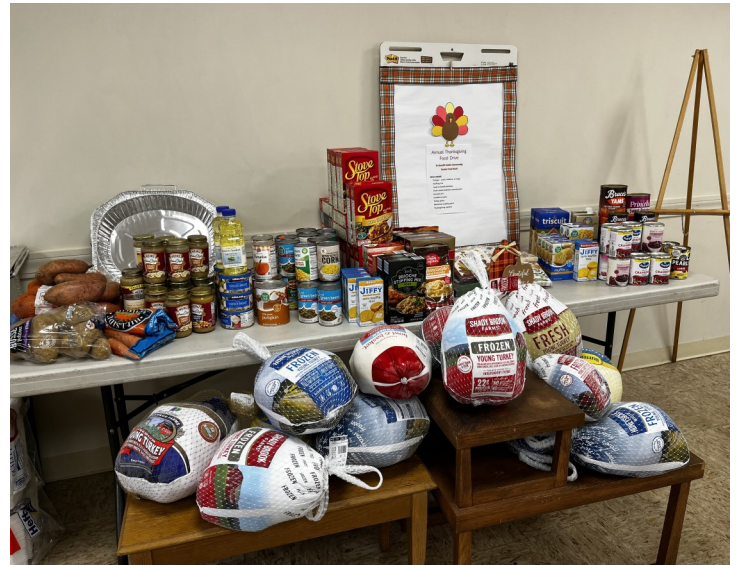
Thanksgiving food donations for the Keefe Community Center

The Outreach Team wishes all of you a hope-filled Advent season and a joyful and blessed Christmas.