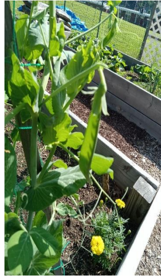
Our first peapod!

Products from animal sources (such as meat scraps, bones, and dairy products) and products containing fats or oils are not good for compost because they can attract other animals and stop the composting process. In addition, processed foods or anything that appears to be diseased should stay out of the compost pile. If you have any questions about what can or cannot be composted, ask Rob Hansen.