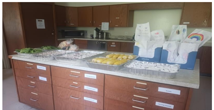
Meal cooked for women in Martha's Place