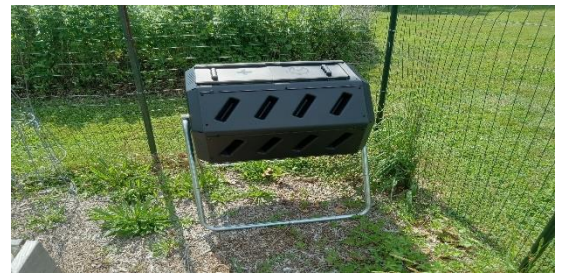
Compost Tumbler; Ready to turn food scraps into compost to feed the garden!