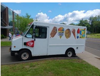
Below: Side View of the Ice Cream Truck CGSLC Sponsored