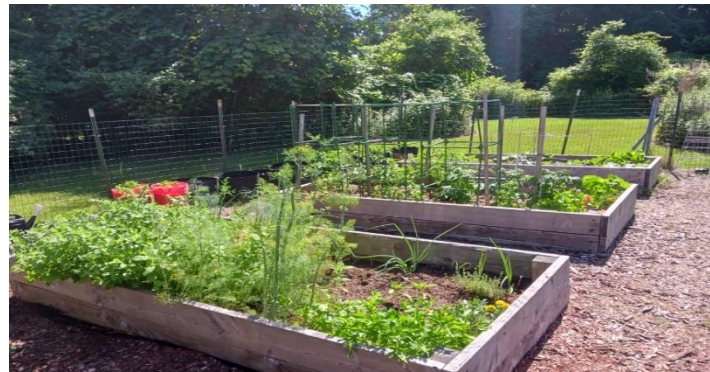
The garden in action.