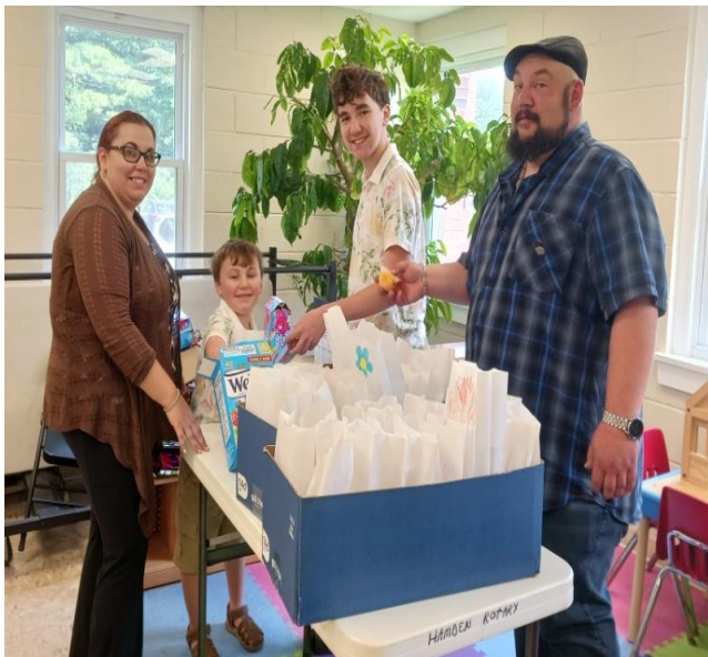
Above: The Papa Family assembling 30 treat bags ofr children living in New Reach Shelter