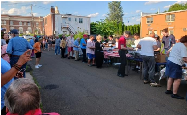
Above: The line at the Dinner for$1 Anniversary

*Friday, June 20 was balmy, but breezy—the perfect evening to celebrate Dinner for a Dollar’s 14th Anniversary in Hamden! This was truly a community effort with volunteers from The United Way, Jordan’s Furniture, Medtronic, and Grace & St. John’s Episcopal. Our contribution of the ice cream truck added to the festive atmosphere. This was the first year for an ice cream truck at the event, and it was definitely a hit and a memorable contribution to a ministry that deserves to be joyfully celebrated! Thank you, CGSLC—our support for Dinner for a Dollar is greatly appreciated!!