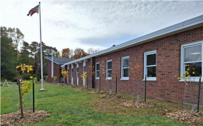
Brand New Shrubs!