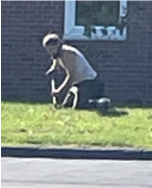
Hard at work