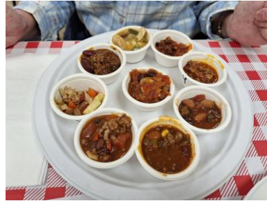
Above :View of 9 selections of chili